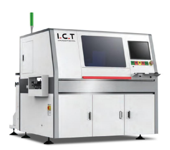
Axial Insertion Machine